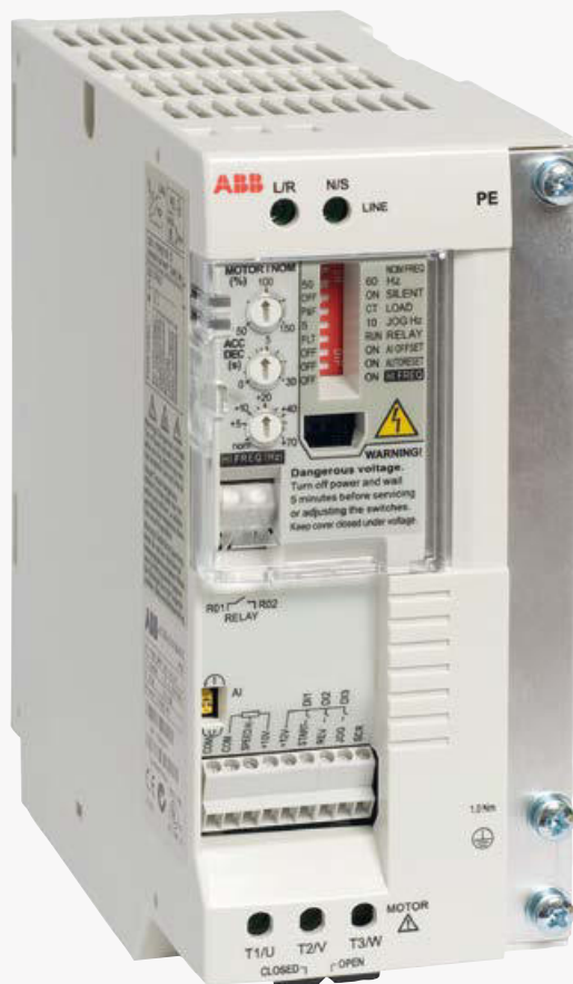
ABB micro drives ACS55, 0.18 to 2.2 kW