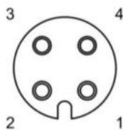
Face View M12 Female