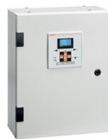
Enclosed automatic transfer switches ATS, with ATL600 controller and four-pole contactors, 100A ATP