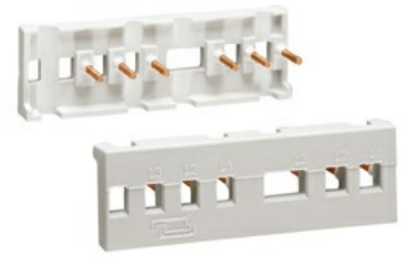
3P Rigid connecting kits for BF26...BF38 BFX3201