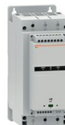
Thyristor modules DCTL