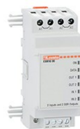
Expansion modules for modular products - inputs/outputs EXM1000