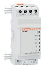
Expansion modules for modular products - inputs/outputs EXM1001