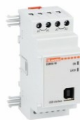
Expansion modules for modular products - communication port EXM1010