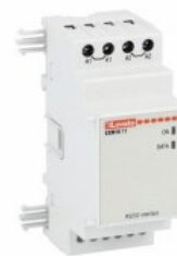
Expansion modules for modular products - communication port EXM1011