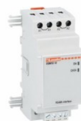
Expansion modules for modular products - communication port EXM1012