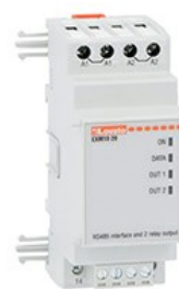
Expansion modules for modular products - communication port EXM1020