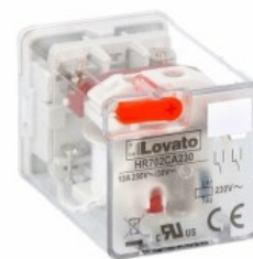
8-PIN INDUSTRIAL RELAYS HR702C