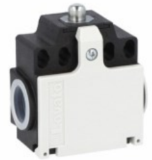
Top push rod plunger KCA