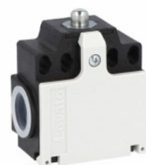
Top push rod plunger KCA