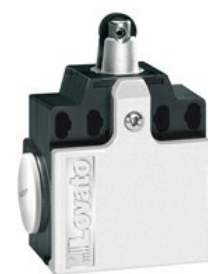
Top roller push plunger KCB