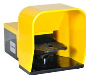
One pedal, with free actuation - with cover KG200