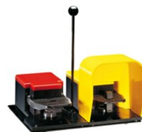
Two pedal, left pedal with free actuation and right pedal with safety lever - left open right with cover KGD003