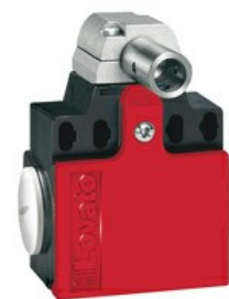
Hinge operating KNP