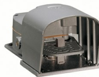
One pedal, with safety lever - with cover KR210