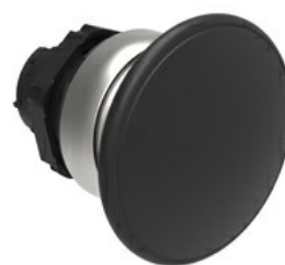
Mushroom head pushbutton, spring return Ø 40mm/1.6" LPCB614