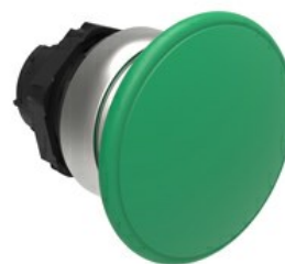
Mushroom head pushbutton, spring return Ø 40mm/1.6" LPCB614