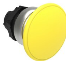
Mushroom head pushbutton, spring return Ø 40mm/1.6" LPCB614