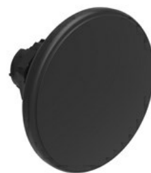
Mushroom head pushbutton, spring return Ø 60mm/2.36" LPCB616