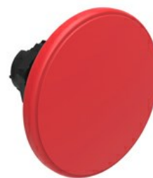
Mushroom head pushbutton, spring return Ø 60mm/2.36" LPCB616