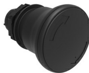
Mushroom head pushbutton, Latch, turn to release Ø 40mm/1.6" LPCB634