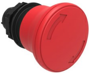
Mushroom head pushbutton, Latch, turn to release Ø 40mm/1.6" LPCB634