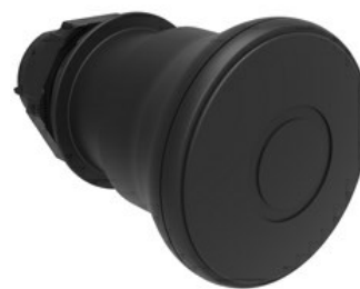
Mushroom head pushbutton, Latch, pull to release Ø 40mm/1.6" LPCB674