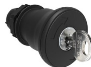
Mushroom head pushbutton, Latch, turn key to release Ø 40mm/1.6" LPCB684