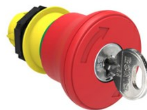
Mushroom head pushbutton, Latch, turn key to release Ø 40mm/1.6" LPCB684