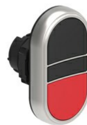
Double-touch actuators, spring return - two flush pushbuttons LPCB71