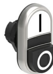
Double-touch actuators, spring return - One extended and one flush pushbuttons LPCB72