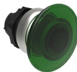
Illuminated mushroom head button actuators - Spring return Ø 40mm/1.6" LPCBL61