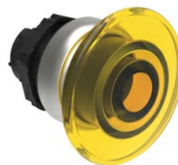
Illuminated mushroom head button actuators - Spring return Ø 40mm/1.6" LPCBL61