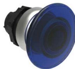
Illuminated mushroom head button actuators - Spring return Ø 40mm/1.6" LPCBL61