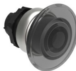
Illuminated mushroom head button actuators - Spring return Ø 40mm/1.6" LPCBL61