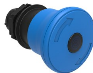
Illuminated mushroom head button actuators - Latch, turn to release Ø 40mm/1.6" LPCBL66