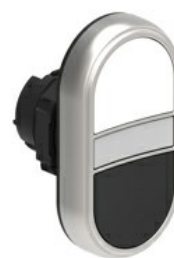
Double-touch actuators, spring return white indicator - Two flush pushbuttons LPCBL71