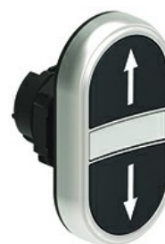
Double-touch actuators, spring return white indicator - Two flush pushbuttons LPCBL71