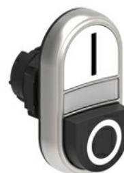
Double-touch actuators, spring return white indicator - One extended and one flush pushbuttons LPCBL72