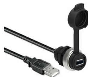
USB interface, A/A female type connection with 0.5m long cable LPCD0