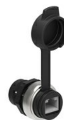
RJ45 interface, Ethernet connection with 1m long cable LPCD0 Cat.5E