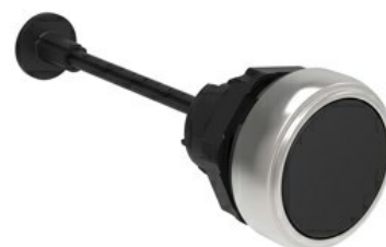
Mechanical reset buttons, complete unit, spring return LPCR10