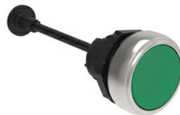
Mechanical reset buttons, complete unit, spring return LPCR10