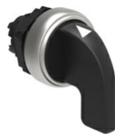
Selector switch actuators long lever - 3 position LPCS23