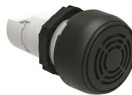
Monoblock buzzer - Continuous or pulse tone LPCZS