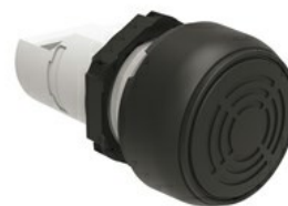
Monoblock buzzer - Continuous or pulse tone LPCZS