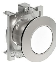
Pushbutton actuator, spring return LPFB10