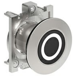
Pushbutton actuators, spring return, with symbol LPFB11