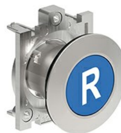
Pushbutton actuators, spring return, with symbol LPFB11