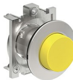
Pushbutton actuator, spring return LPFB20